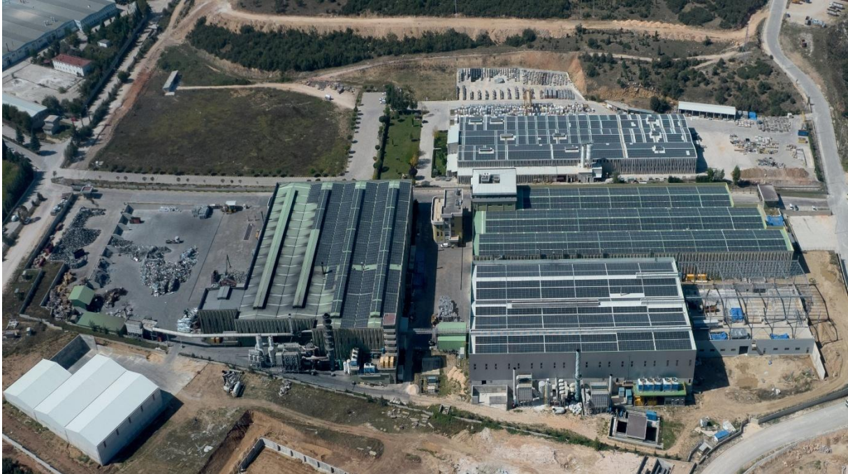
Figure 1. Arslan Alüminyum General View

The head office of Arslan Aluminium is located in Kağıthane, İstanbul, where customs operations and financial affairs are managed.