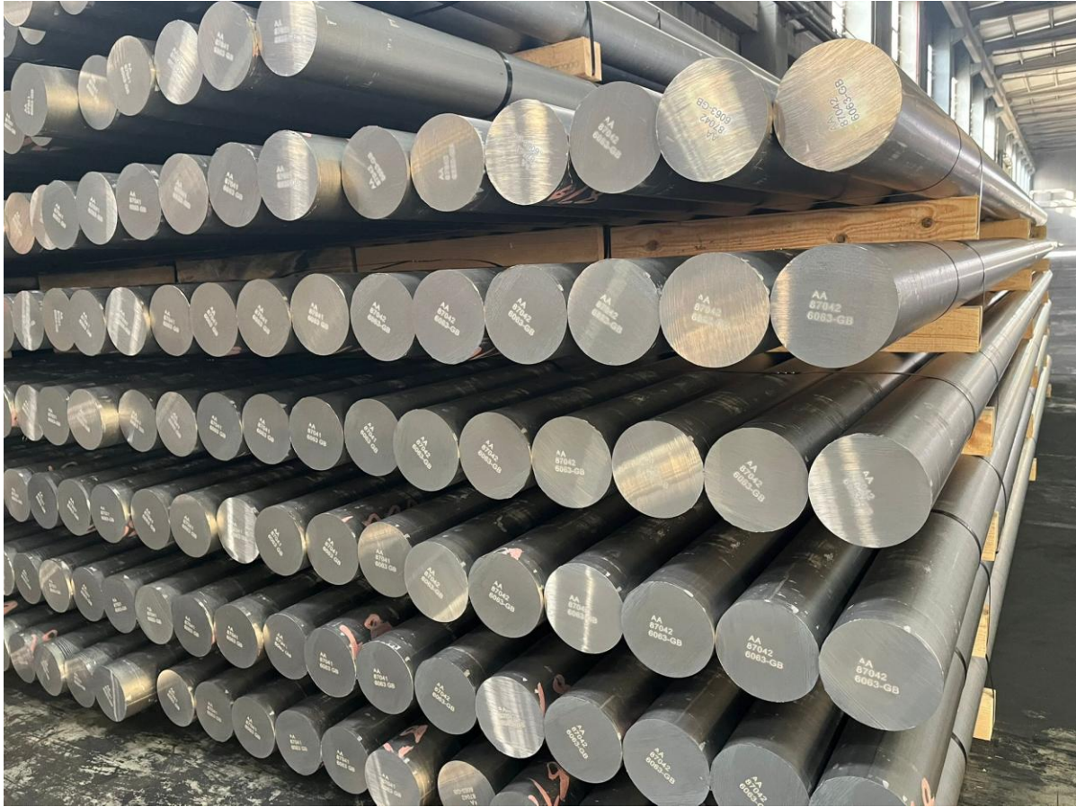
Figure 2. Visual Representation of the Product

Product identification: The Green Billet is a semi-finished product used as the primary raw material in aluminium extrusion processes.